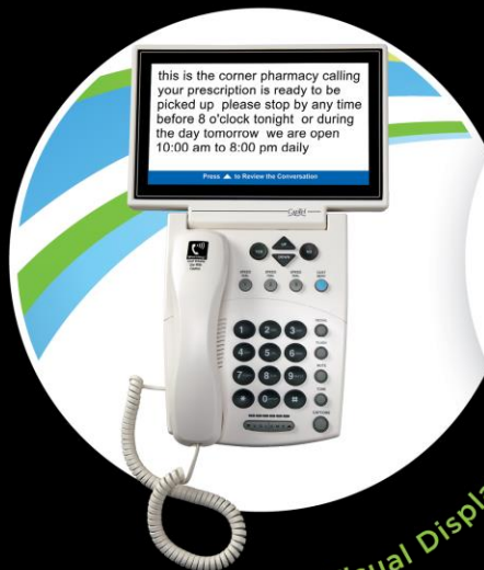
Large Visual Display

Captioned Telephones that fit your lifestyle.