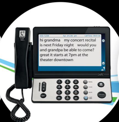
Touch Screen Phones